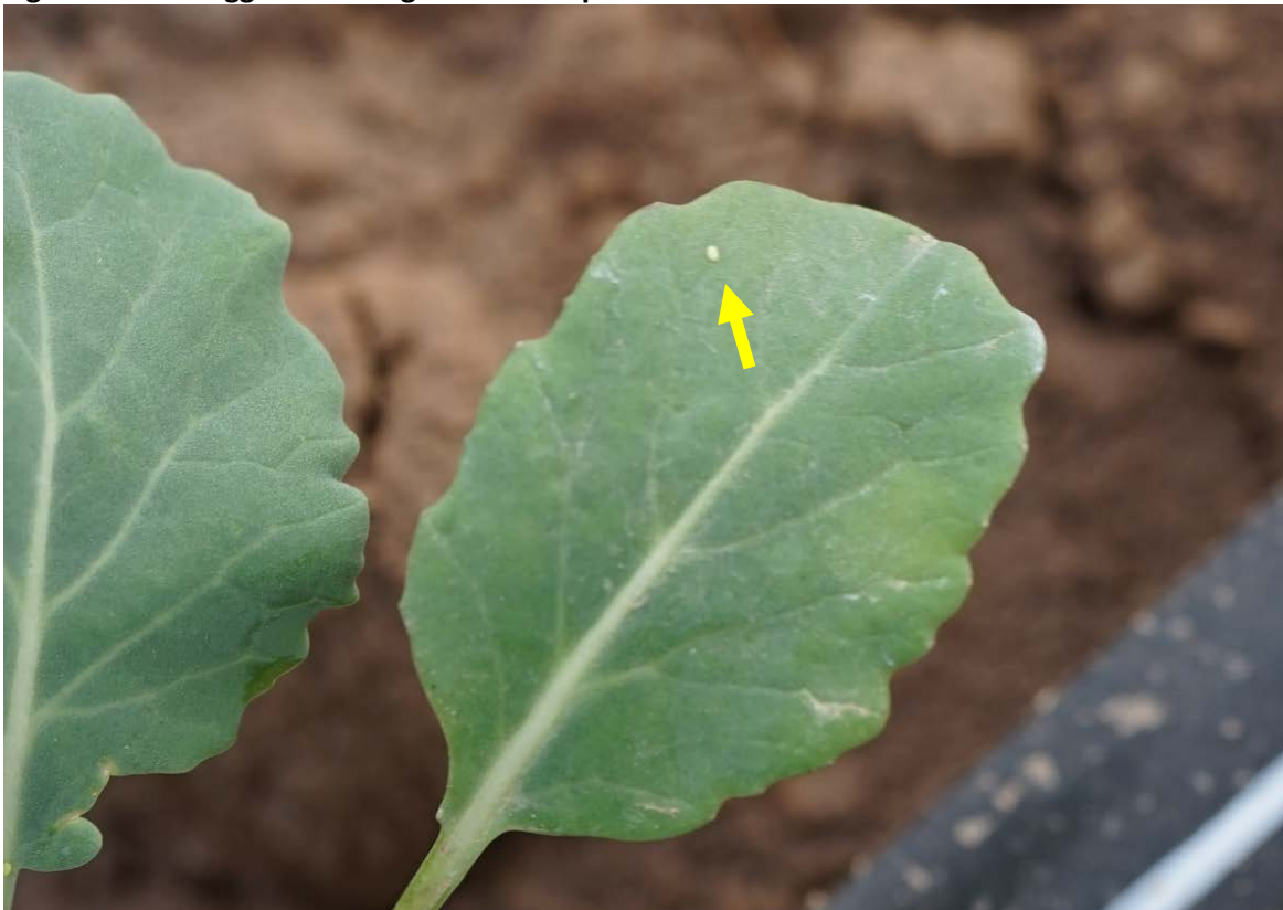
Figure 2. DBM egg on seedling cauliflower plant